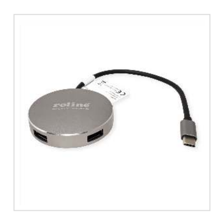
USB 3.0 / USB 3.2 Gen 1 Hub in grey aluminium for connecting up to four peripherals and storage devices to a MacBook, Ultrabook or other device with USB Type C interface.